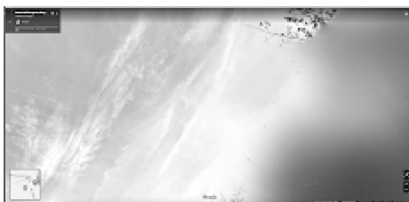
Screen Shot 2022-10-02 at 7.07.49 PM.png 1618K