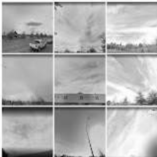
Screen Shot 2022-10-02 at 7.01.13 PM-COLLAGE.jpg 270K